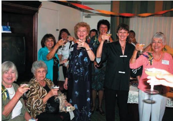
District II members and guests raise a toast to Soroptimist International of Orlando, Holiday Isles and Tampa as they jointly celebrate their 50th birthdays.